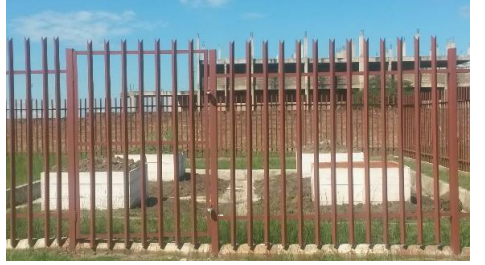
Repaired the pilot test site 2nd Mar 2018

Put PVC pipes for embankments to refine on the collecting samples etc.