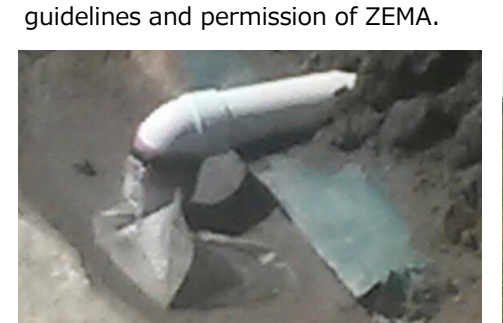
After - Embankments-