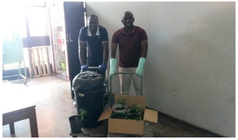
End of the JPN fiscal year